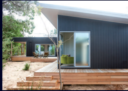
Balnarring Beach - Single Storey Residential