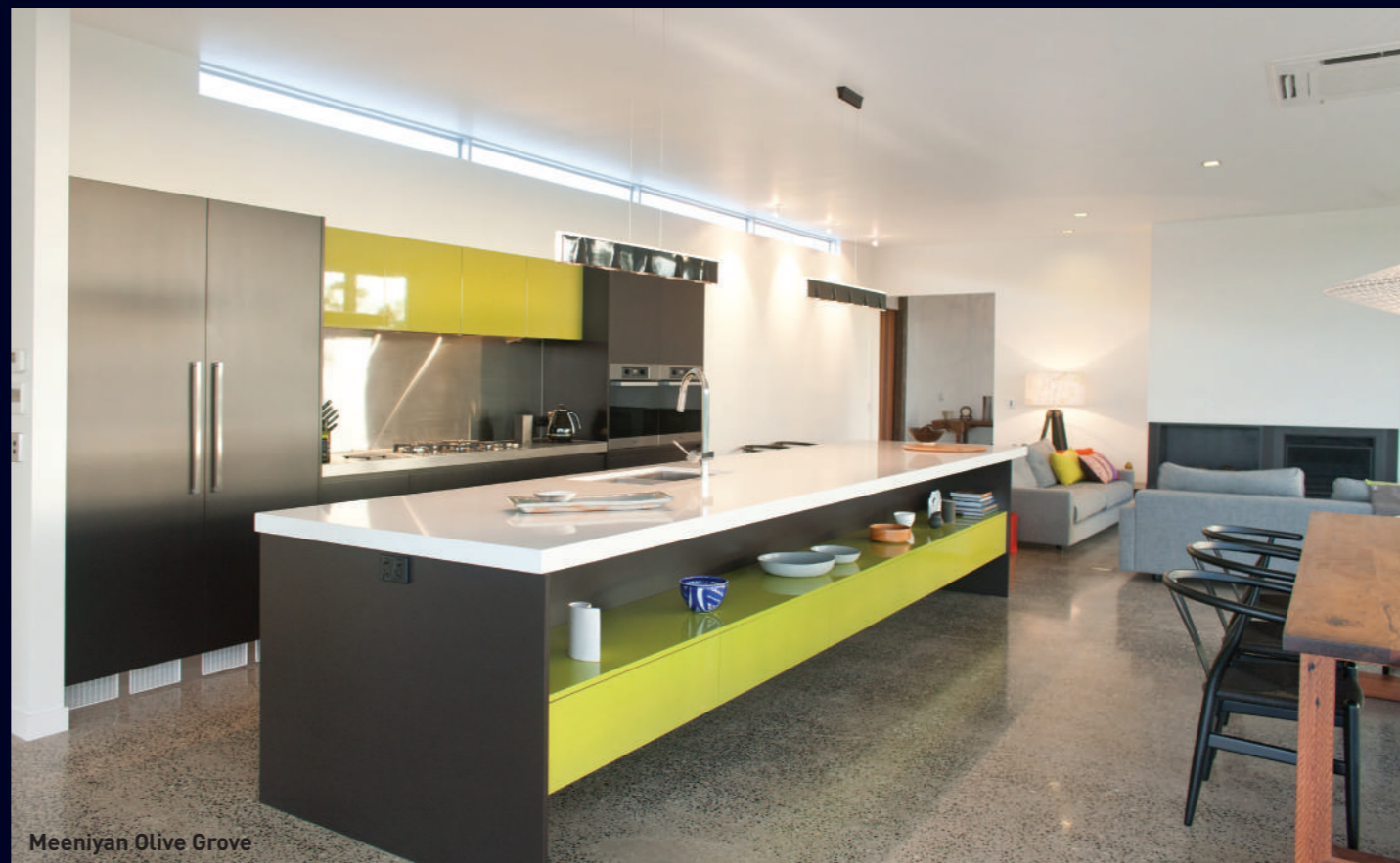
Meeniyah Olive Grove

Our knowledge of sustainable design methods ensures your home can be environmentally friendly and achieve the highest possible energy rating. Our designs make the most of natural elements such as sun, shade, air circulation, building materials and water conservation so you can reduce energy output, save money, save water, decrease waste and improve the health of you and the planet.