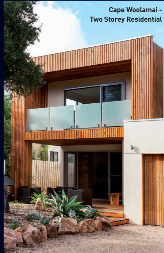
Cape Woolamai - Two Storey Residential