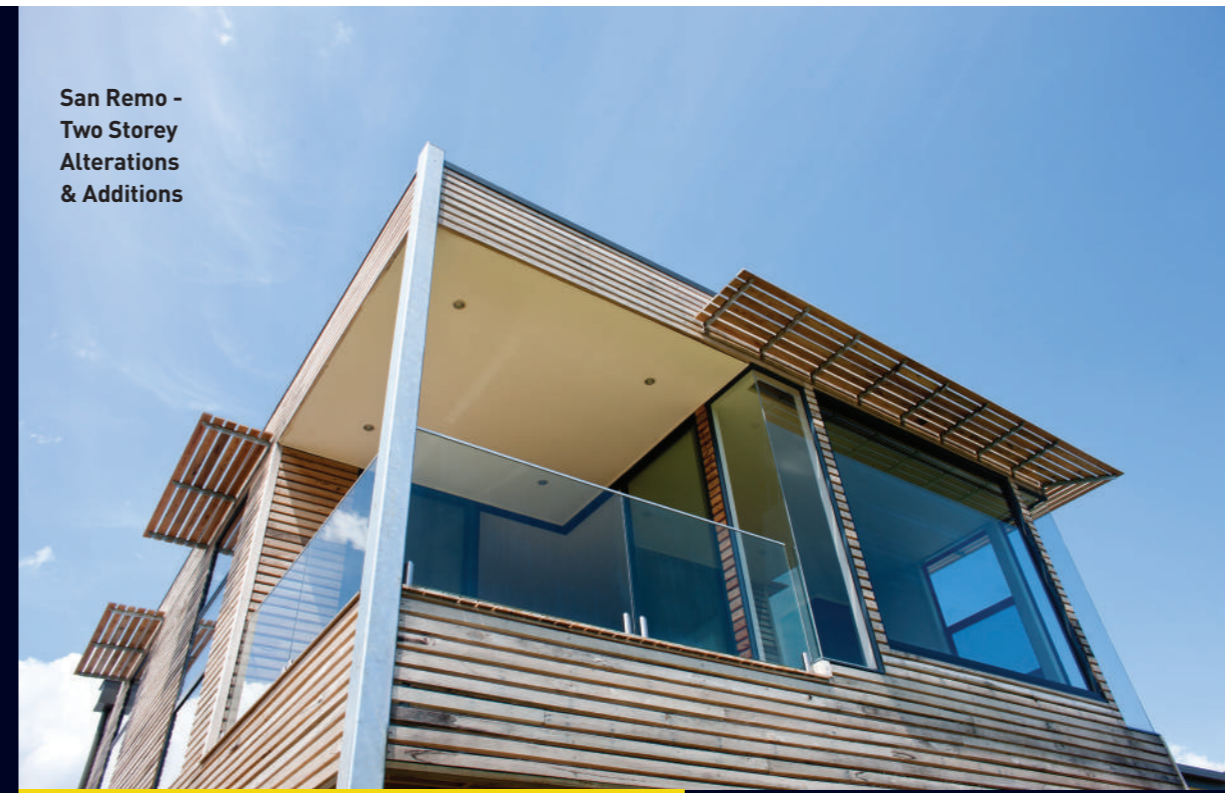
San Remo - Two Storey Alterations & Additions