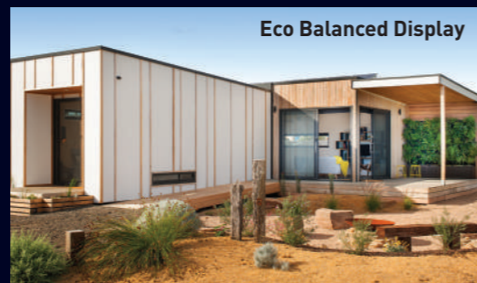
Eco Balanced Display