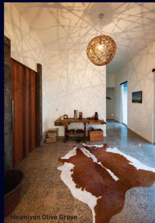
Meeniyah Olive Grove