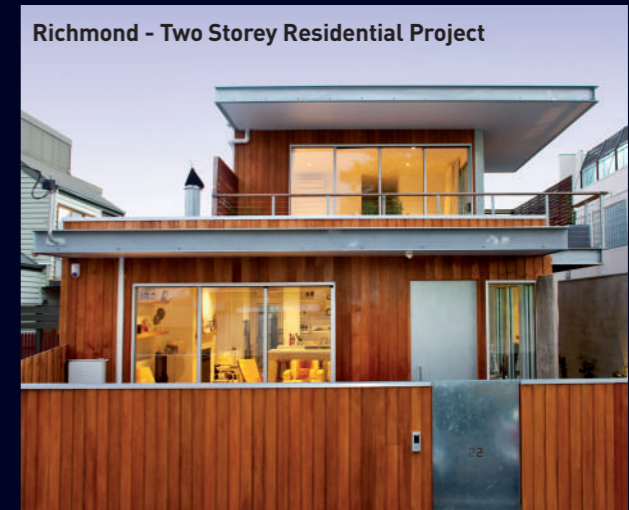
Richmond - Two Storey Residential Project