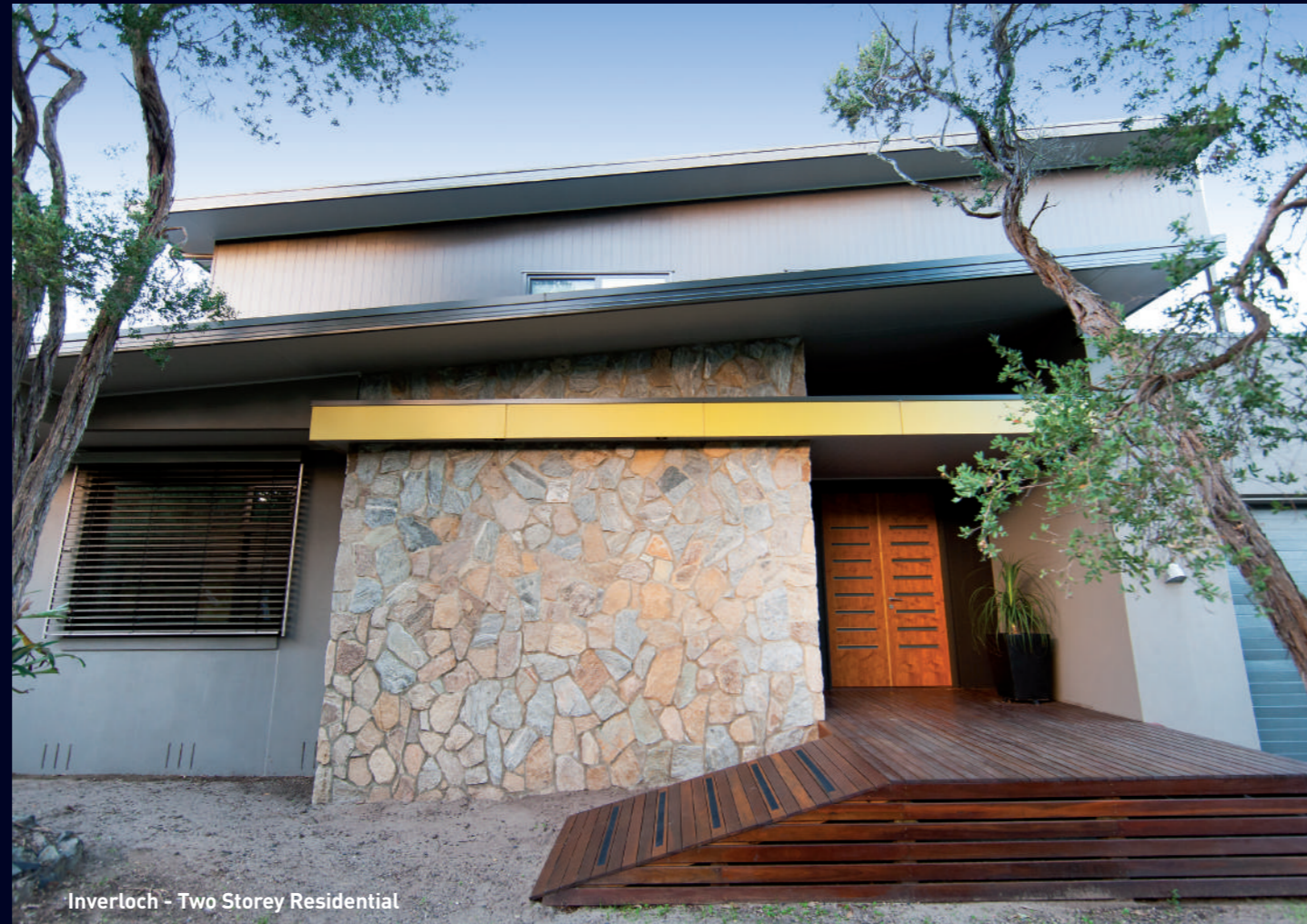
Inverloch - Two Storey Residential