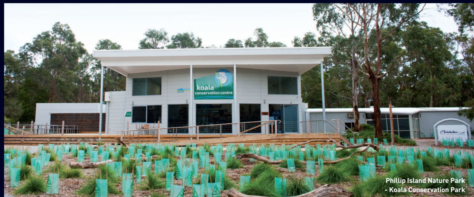
Phillip Island Nature Park - Koala Conservation Park

Beaumont Concepts building designers revels in the challenge of maximising the return on your investment. By actively exploring various possibilities, balancing space efficiency, plot ratio, infrastructure and private living space to provide a socially responsible and environmentally conscious living environment. We add to that a design flair that makes you stand out in a competitive real estate market to ensure your investment sells.