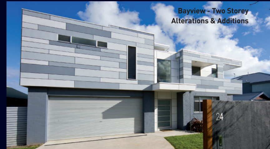
Bayview - Two Storey Alterations & Additions

Beaumont Concepts Designs are unique. Each individual design is carefully matched to your environment, desires and your lifestyle. Because we examine and discuss your requirements and objectives in detail at the commencement of each project, you can be assured that your design is meticulously crafted and will be unique. Your dream home will be healthy, comfortable, environmentally friendly, cost-effective, livable, functional and stylish. On completion of the design and permit process we have a range of local builders that can provide you with a construction quotation to make your concept a reality.