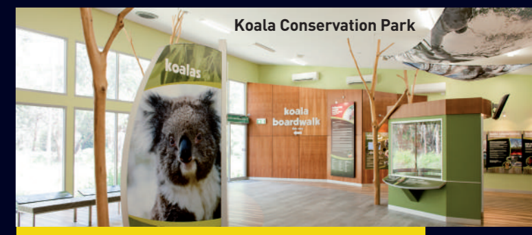
Koala Conservation Park

Offering designs for a variety of commercial and industrial projects, Beaumont Concepts can provide you with the necessary information and documentation to have your project completed in an efficient, timely manner. Experience with a variety of construction techniques, materials and having worked in many industries provides us with the knowledge and experience you need for your commercial project.