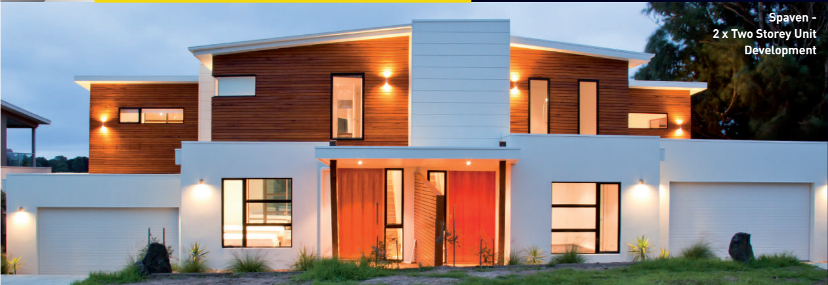
Spaven - 2 x Two Storey Unit Development