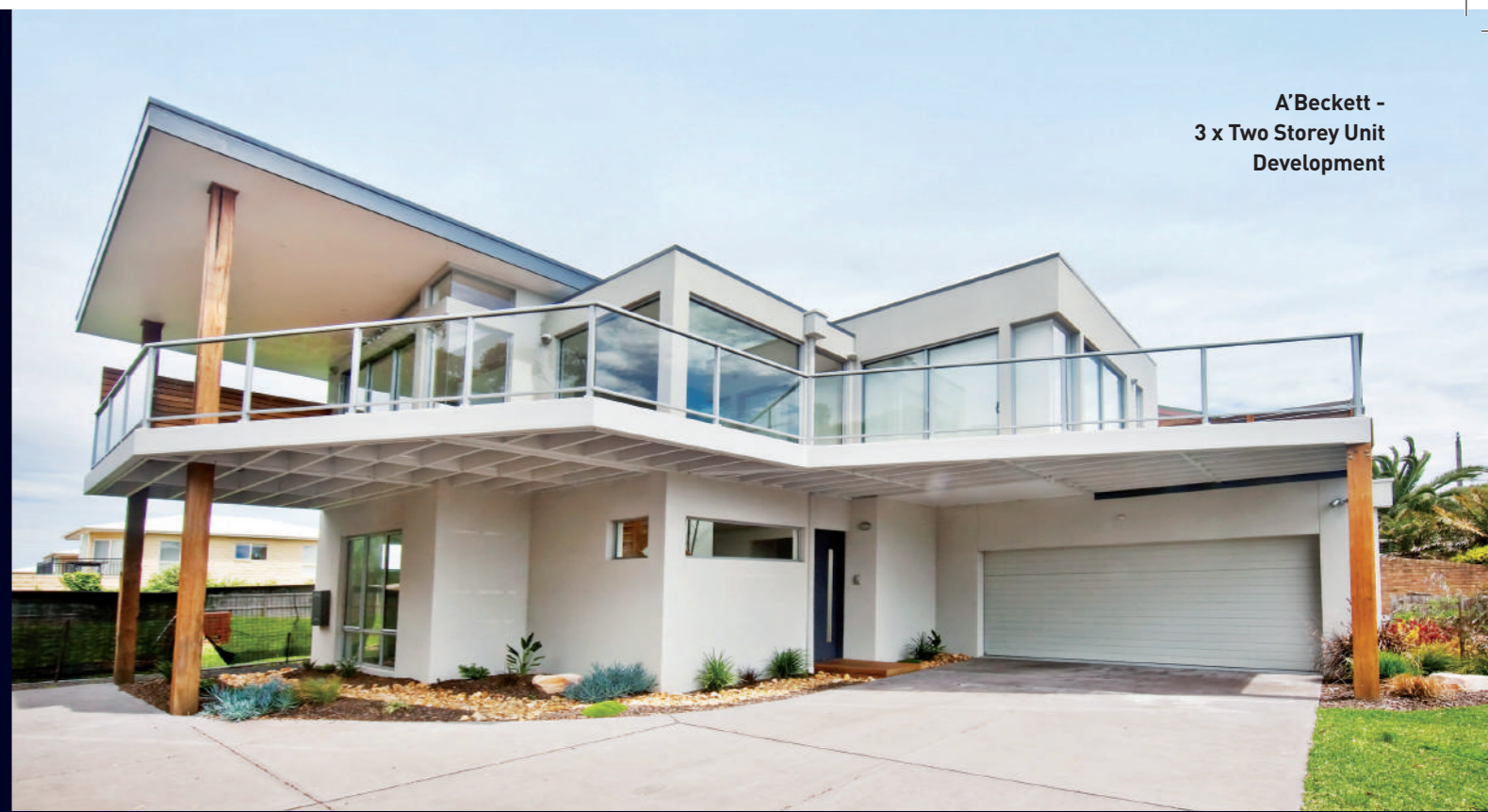
A'Beckett - 3 x Two Storey Unit Development