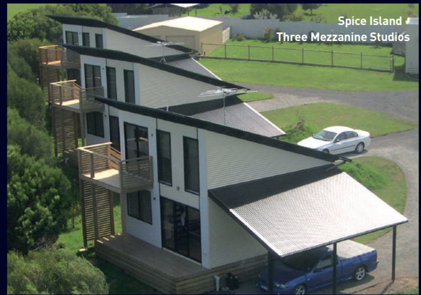
Spice Island Three Mezzanine Studios