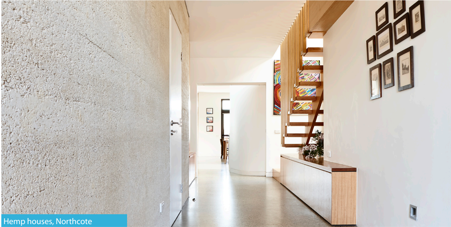
Hemp houses, Northcote