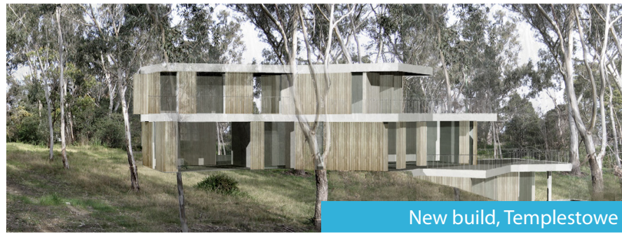
New build, Templestowe