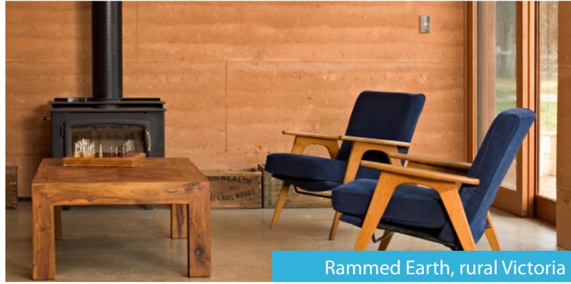
Rammed Earth, rural Victoria