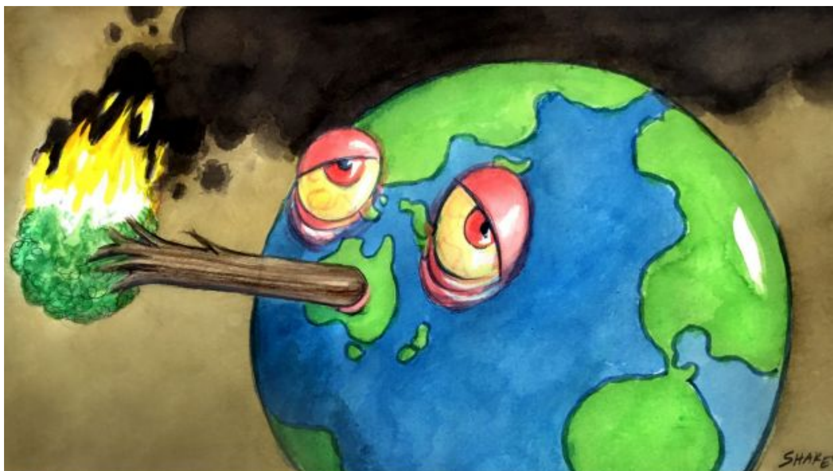
Illustration: John Shakespeare

Our log cabin was at the end of a dirt road, surrounded by stringybark, spotted gum and the sounds of kookaburras and lyre birds.