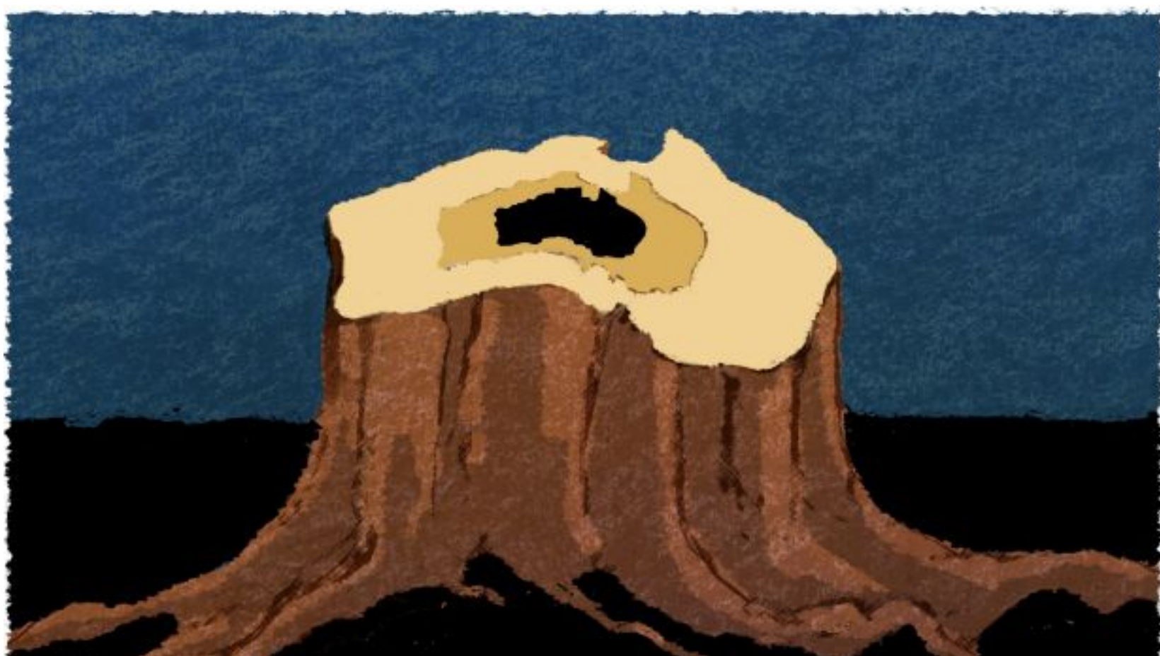
Illustration: Andrew Dyson

Now the bottom has fallen out of the woodchip market, you might finally think the gig is up. Instead there's a push to burn the forests and call it "renewable energy".