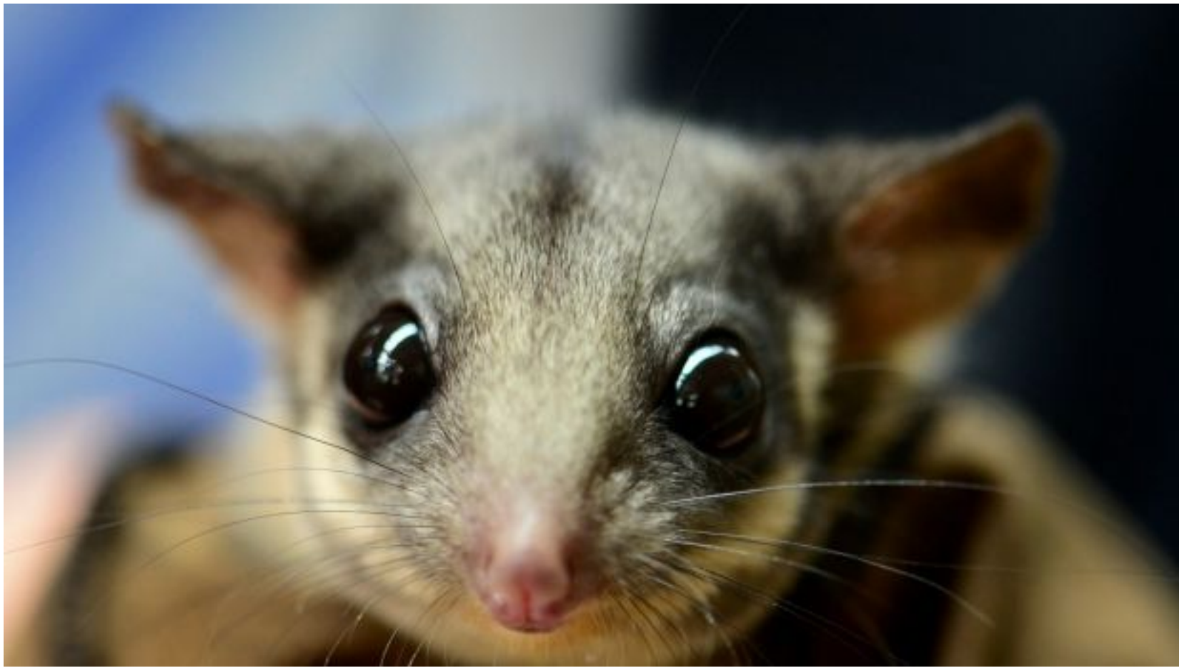
The plight of the Leadbeater's possum has been a political issue in Victoria.

Now most of the native forest near my childhood home is gone, clearfelled and sold to the Japanese for woodchip.